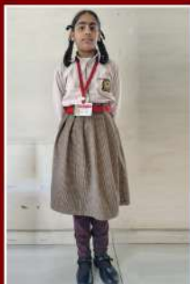
NURSERY TO 5TH