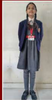
6TH TO 12TH