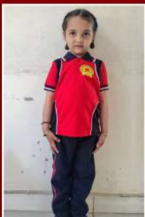
NURSERY TO 12TH