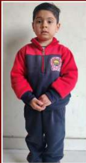
NURSERY TO 12TH