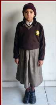
NURSERY TO 5TH