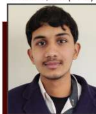
GURPYAR (10th) VOLLEYBALL, Distt. Participate