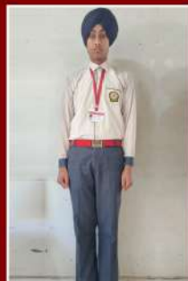
6TH TO 12TH